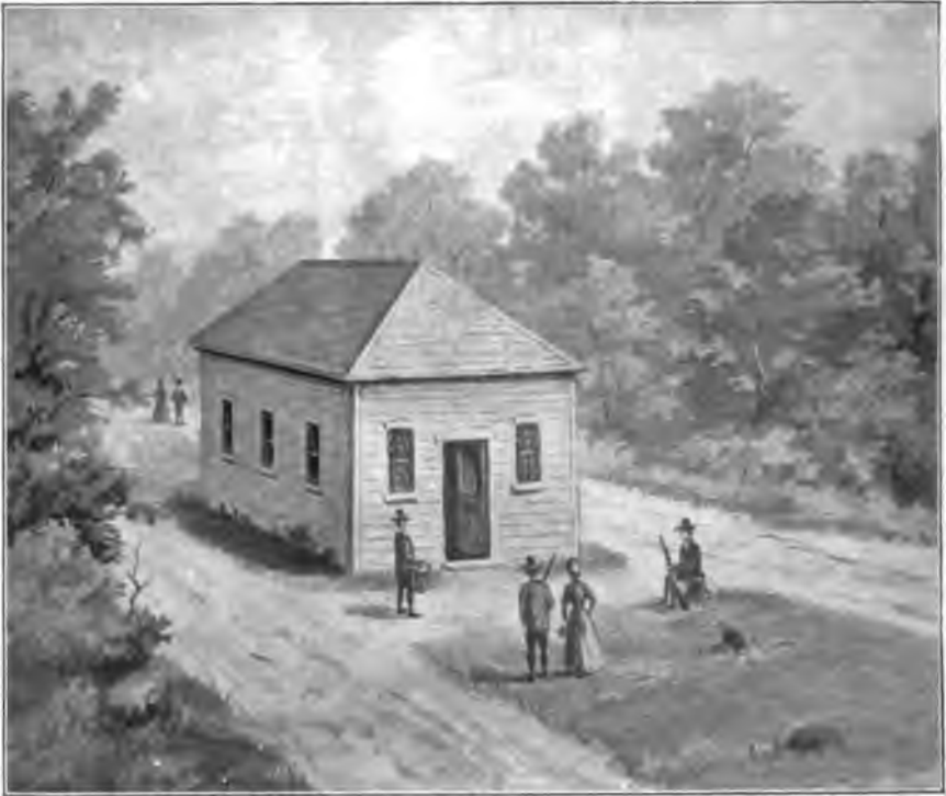
CONJECTURAL APPEARANCE OF FIRST EDIFICE.